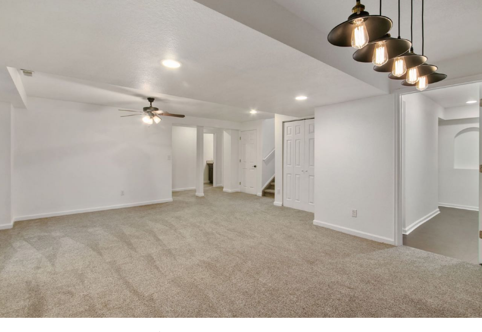
The finished basement affords

an extra living space, a wet-bar with wood-look porcelain tile flooring, a walk-in shower, tankless hot water heater, storage area, & an all-in one washer/dryer combo unit.