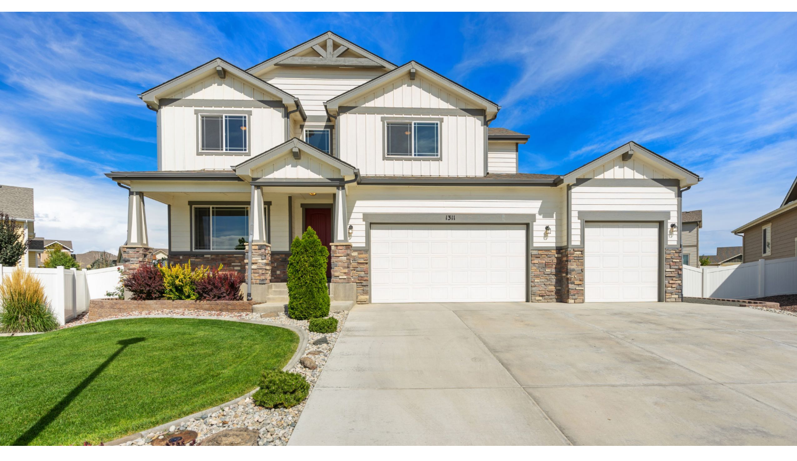
$615,000 Four Bedrooms + Main Level Office • Three Bathrooms

Stunning, move-in ready home located on a quiet cul-de-sac, with a large lot in the desirable Aspen Meadows Subdivision.