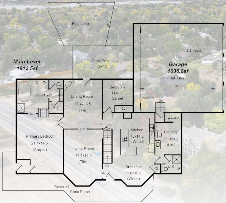
Main Level 1912.5sf

Only an eight-minute drive to Old Town Fort Collins, this home offers an incredible and highly sought-after location on the north side of town, nestled between Long Pond Reservoir, Terry Lake, and Lindenmeier Lake.