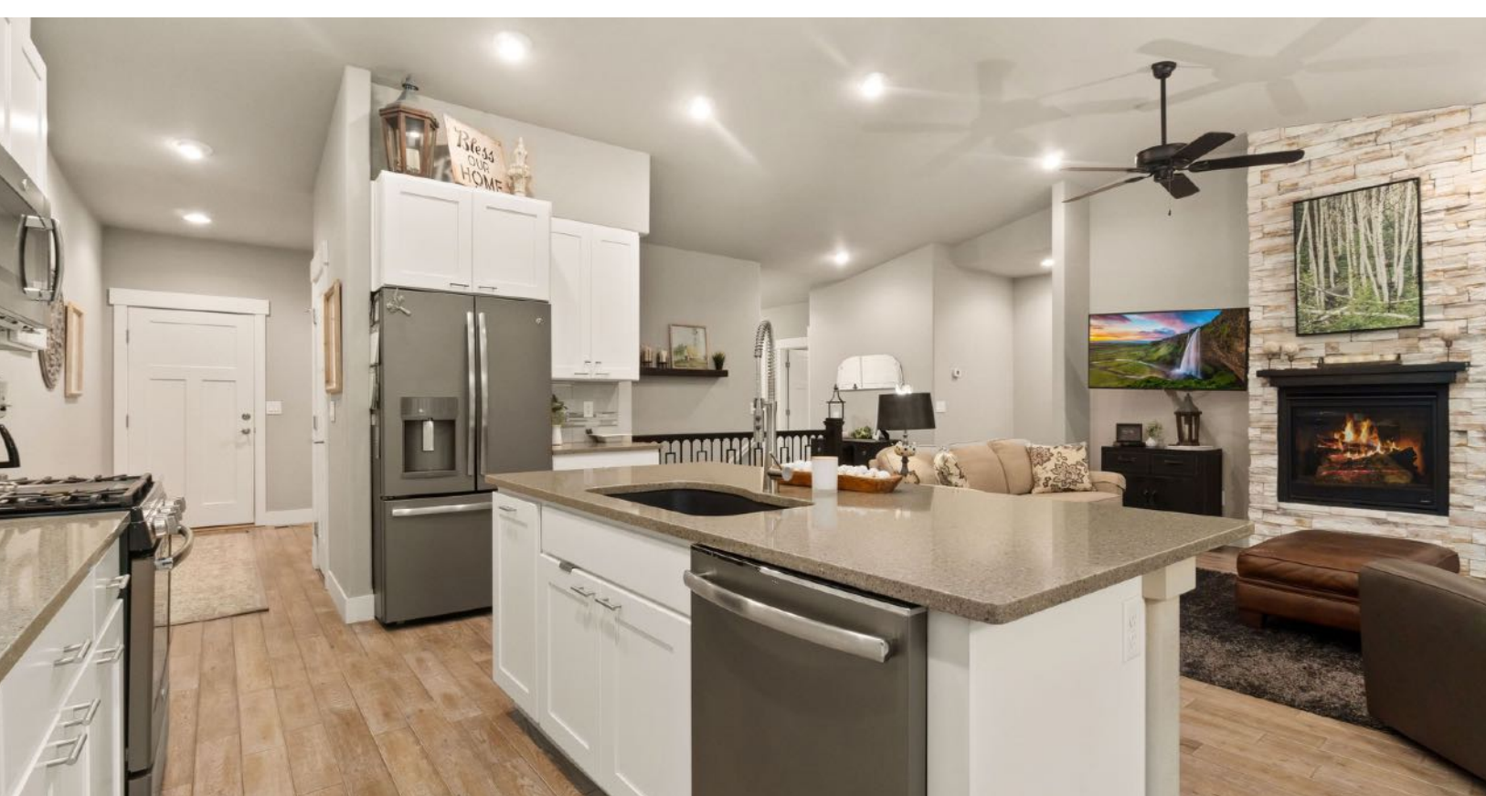
The kitchen is absolutely perfect & overlooks the living area, featuring a beautiful gas fireplace