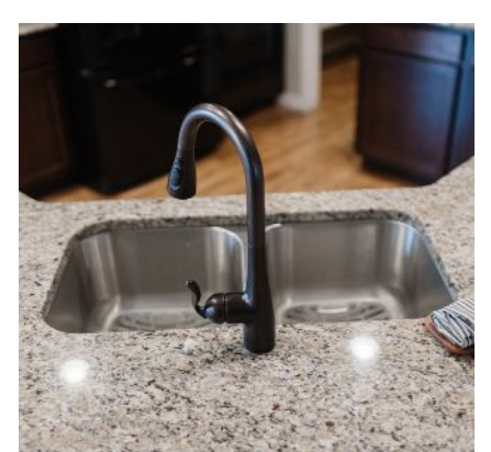
cabinetry, double oven, gas range, & under-mount sink!