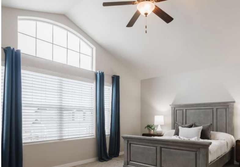
with vaulted ceilings has a 5-piece ensuite bath, double walk-in closets & access to the laundry from the ensuite & hallway!