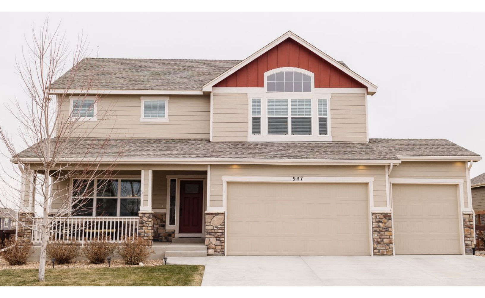
$685,000 + $5,000 in Seller Concession! Four Bedrooms • Four Bathrooms • Four Car Garage

Pride of ownership shows in every space of this immaculate home. Enjoy the meticulously kept backyard paradise with pergola, fire pit, garden beds and the east-facing covered patio for cool summer entertaining!